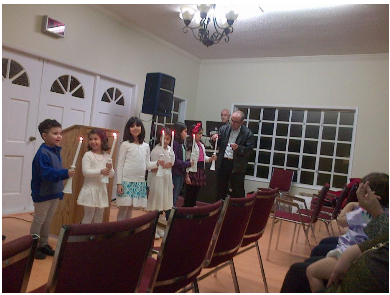
We got together on February 1<sup>st</sup> 2014 and celebrated Sadeh. ZSBC had provided dinner and desserts followed by dancing till midnight. Thank you to participants that made such a great night.